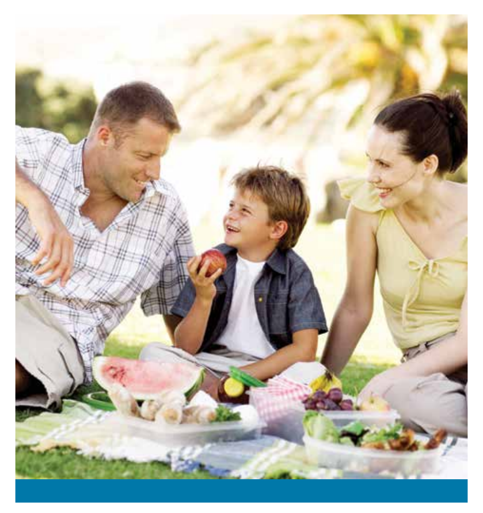
Guidelines for Children 6 to 12 Years Old