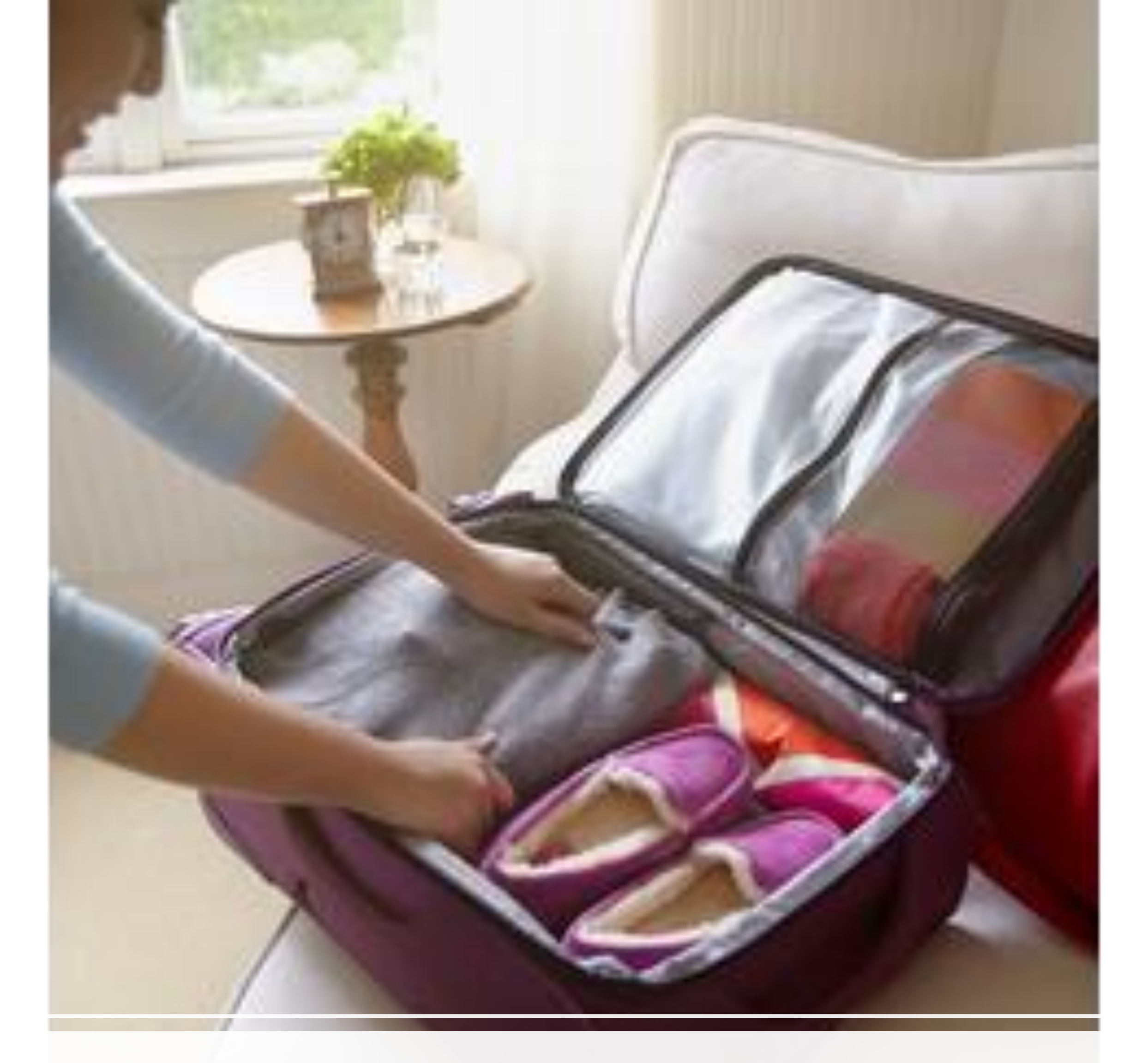
What to bring to the hospital